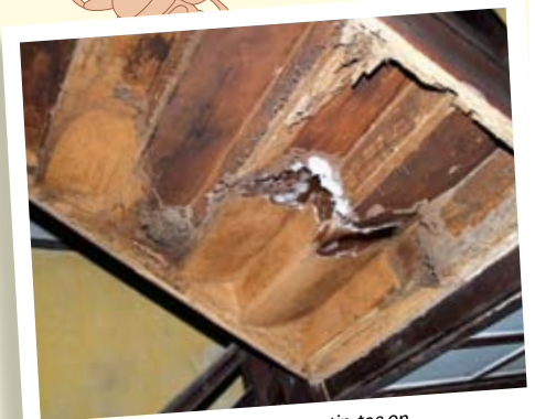
Damaged staircase, unsafe to even tip-toe on