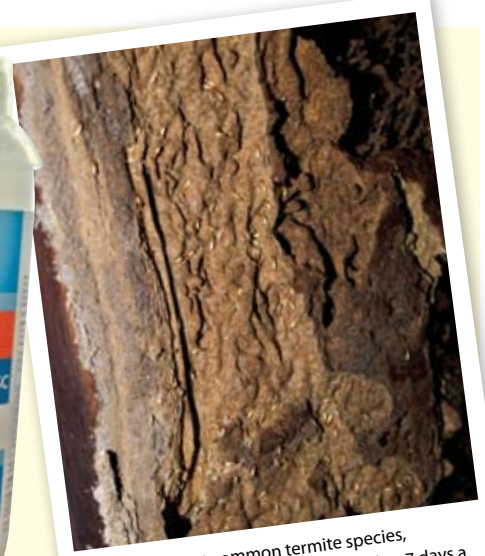
Singapore's most common termite species, Coptotermes gestroi , works 24 hours a day, 7 days a week, without overtime pay or annual leave

Most of us think that the best way to eliminate subterranean termites is to drown them with some pesticide. A sense of relief descends when we see them kick a few times and then disintegrate.