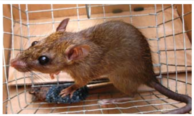
The innocent looking host is not affected by the Leptospira sp. bacteria it carries.

cuts and open wounds with an antiseptic cream or gel and have them well covered with waterproof dressing, especially when we travel overseas.