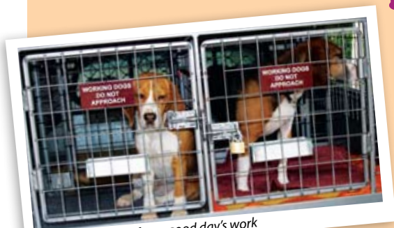
Time to go home after a good day's work

We are familiar with sniffer dogs employed worldwide in the detection of drugs, bombs, fugitives and even pirated compact discs/digital video discs. So why not pests?