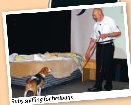
Ruby sniffing for bedbugs